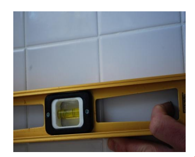
1. Use level and mark location for bar placement.