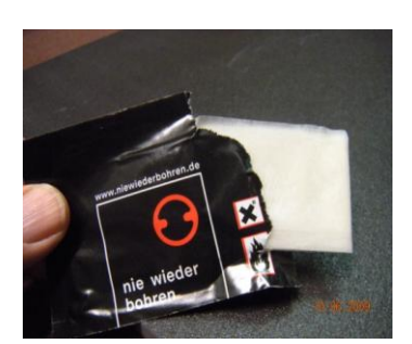
2. Use supplied cloth to clean surface, allow 1 hour to dry completely. Do not use household cleaners. Wipe with clean dry cloth after dry